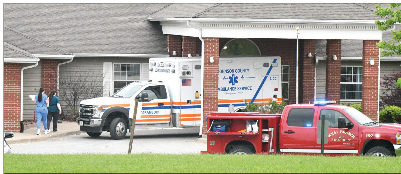
Johnson County Ambulance Service, West Branch Fire Department, and West Branch Police Department responded May 16 to a 911 call that a man was found with a bag over his head. He was later pronounced dead.